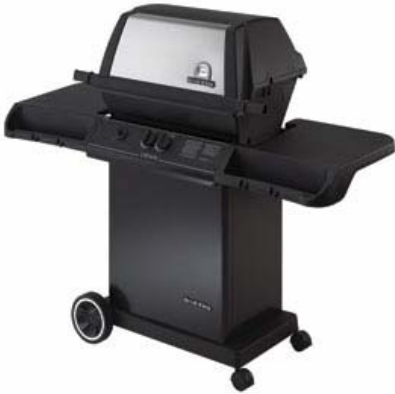
Broil King Crown 20 natural gas barbeque, donated by Enbridge.