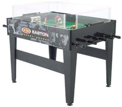
Easton deluxe 2-in-1 rod hockey & soccer table game from Canadian Tire.

Bushnell 675 x 4.5" reflector telescope with computerized "Go to" technology and Real Voice Output that describes the wonders of the night.